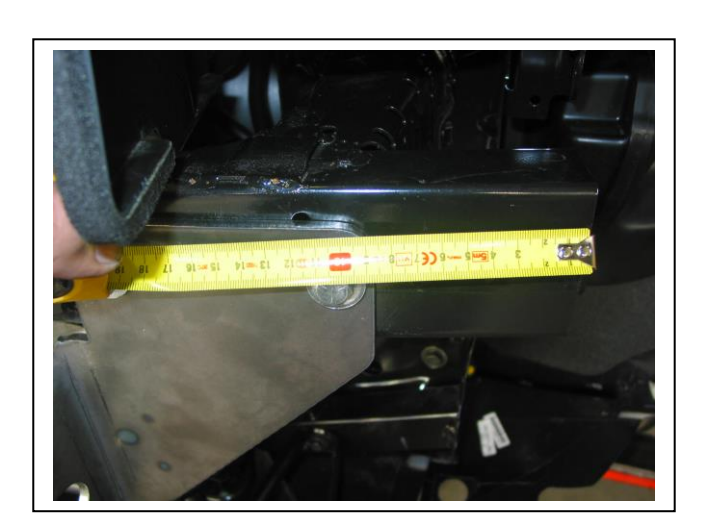
Figure 3: Mark edge of ECB Steel Mounting Bracket on bumper support. (87mm)