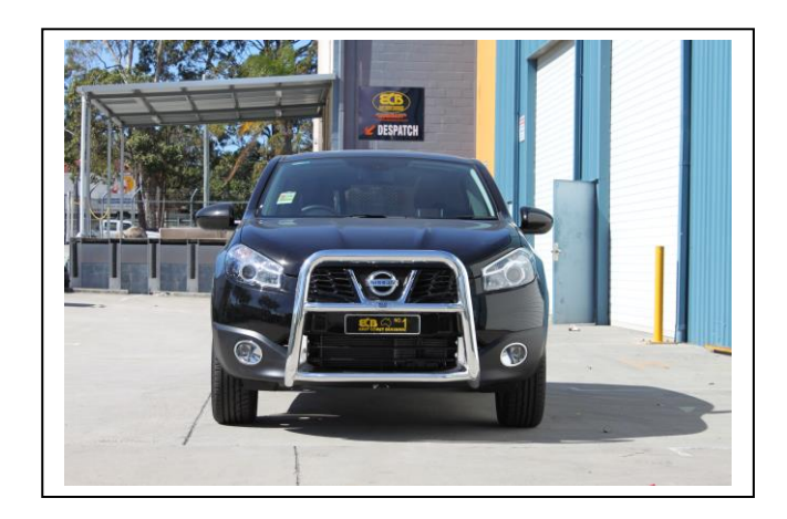
Figure 9: Series 2 Nudge Bar Front View