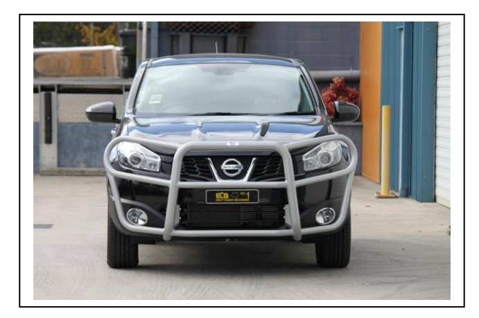
Figure 11: Type 8 Front View