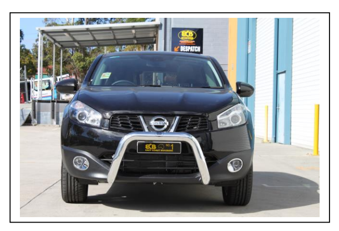
Figure 7: Nudge Bar Front View

29 Snook St Clontarf QLD 4019 Australia Po Box 122 Margate QLD 4019 Australia