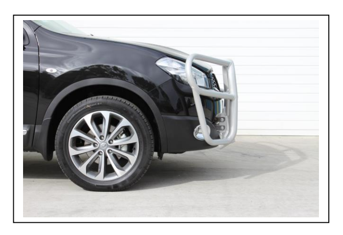
Figure 12: Type 8 Side View