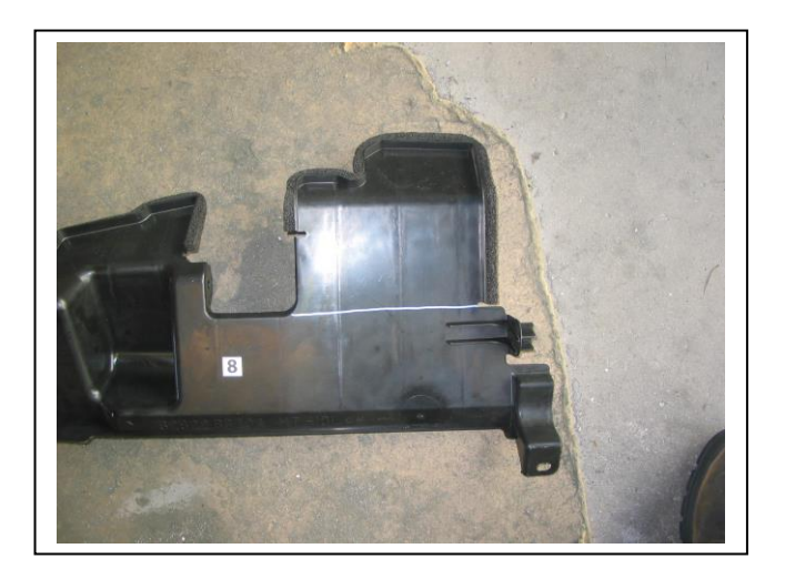
Figure 6: Trim drivers side air ducting.