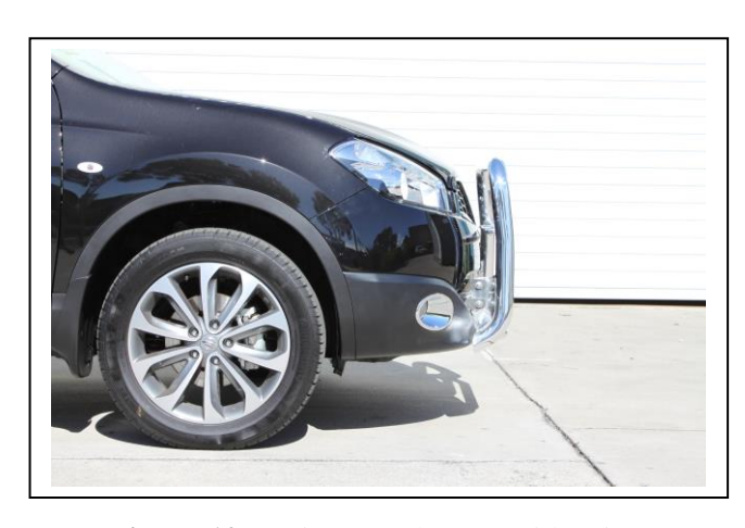
Figure 10: Series 2 Nudge Bar Side View