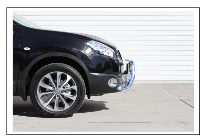
Figure 8: Nudge Bar Side View