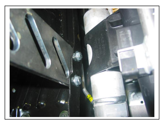
Figure 5: Bolts must be placed for dryer side out. Damage to vehicle may occur if bolts are incorrect.