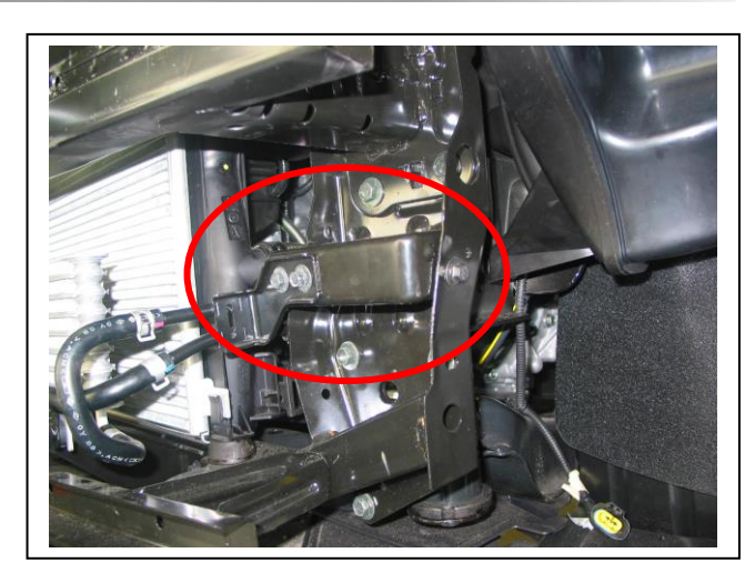
Figure 2: Remove power steering hose mount